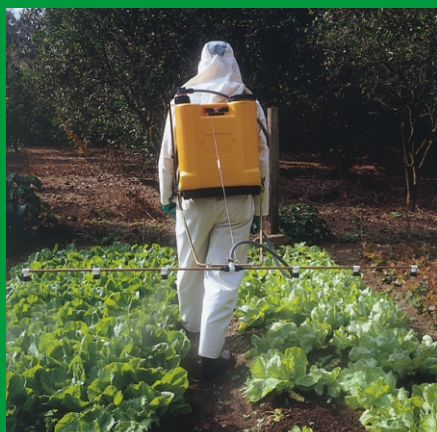
Rampe arrière horizontale - code 9888 - accessoires en option