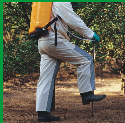
Applicateur d'injection au sol - code 4575 - accessoires en option