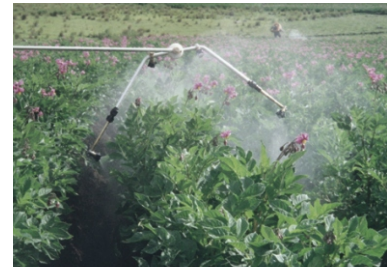
Potato boom - code 4306