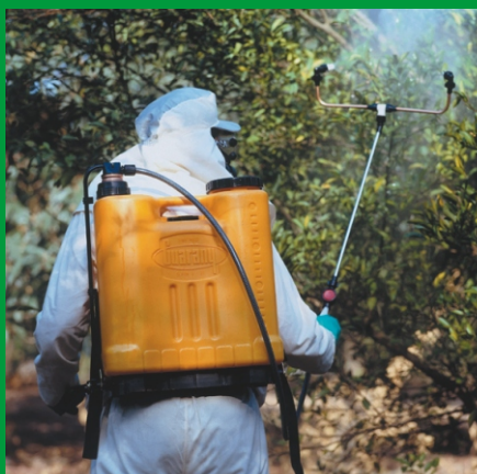
Rampe universelle - code 9798 - accessoires en option