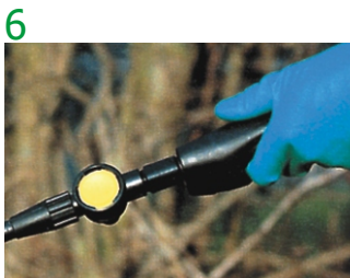
Eezispray valve - code 9984