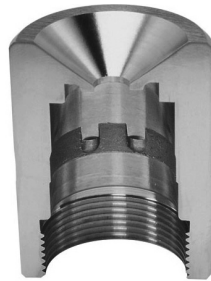
Cutaway view of carrier showing lugs and BETE's unique locking design