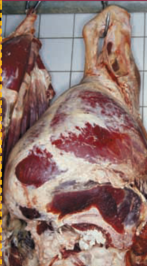
Meat & Poultry Processing