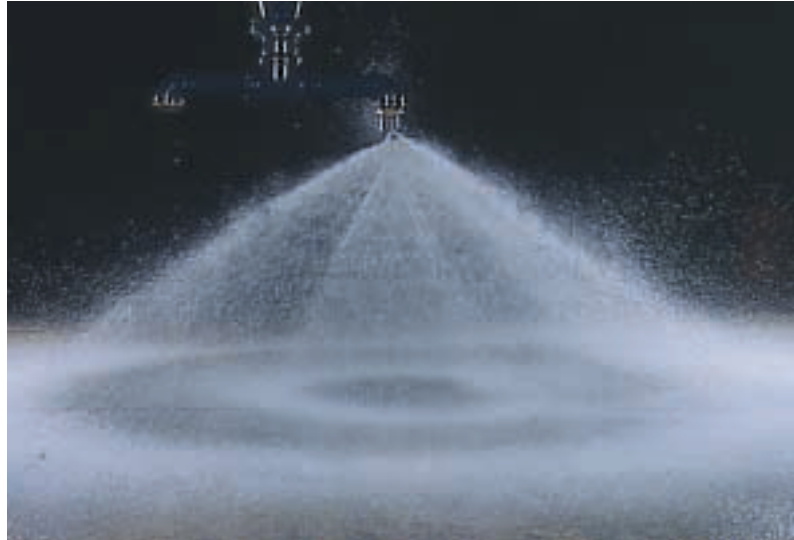
TF spiral nozzle test in BETE Spray Lab