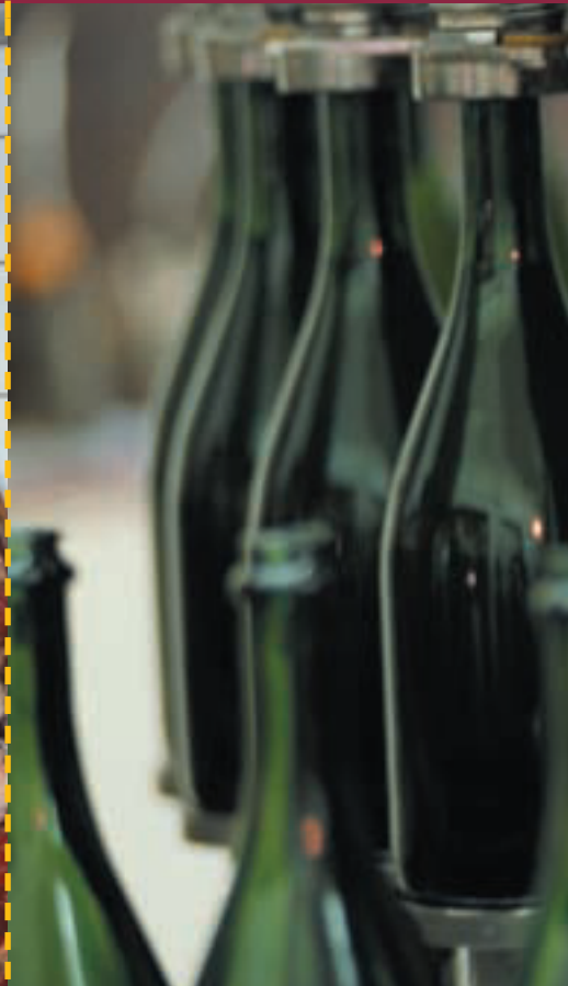
Food & Beverage Production

BETE® products are used in all aspects of the food industry, ranging from large-scale raw foods processing to the application of the shell on little chocolate candies. Whether you use a standard product or specialized design, BETE delivers innovation, quality and value.