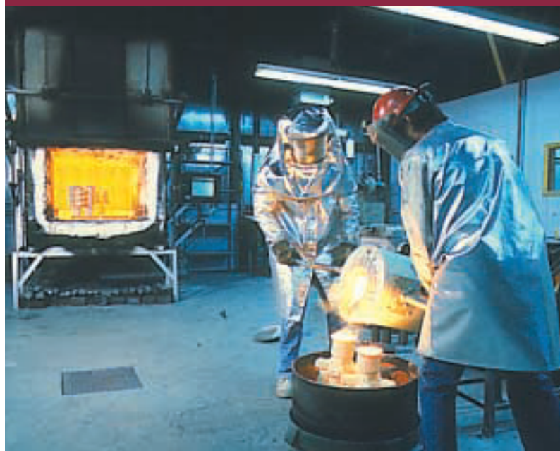
In-house investment casting foundry