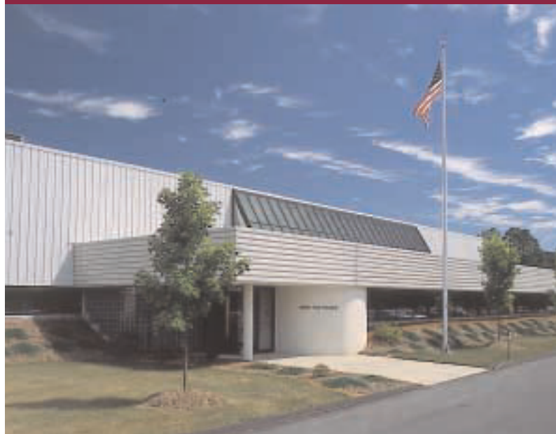
BETE World Headquarters, Greenfield, MA